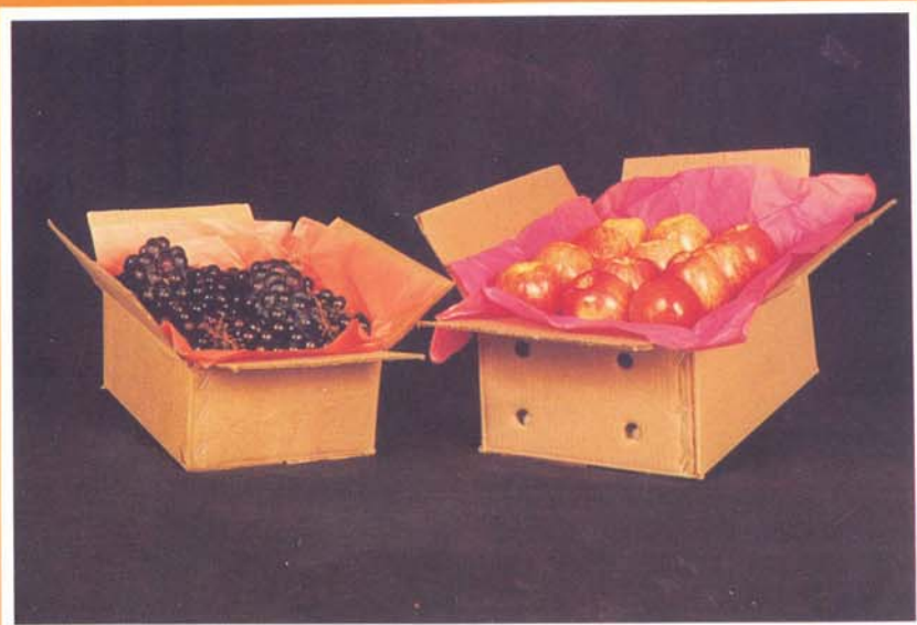
Corrugated Boxes from Cotton Plant Stalks Packed with Fruits

Quality of these boxes is on par with those made from conventional raw materials. The packed fruits have better and more uniform ripening behaviour, good flavour, texture and better shelf life.