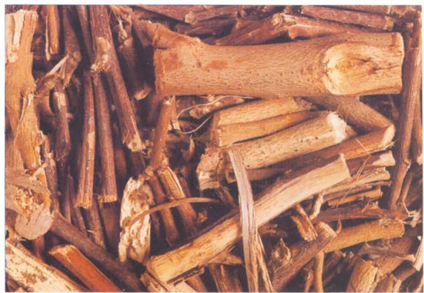
Chipped Cotton Plant Stalks

Corrugated boards of 3, 5 and 7 ply prepared from the kraft paper can be used for making boxes of various dimensions for packaging and transportation of fruits and vegetables.