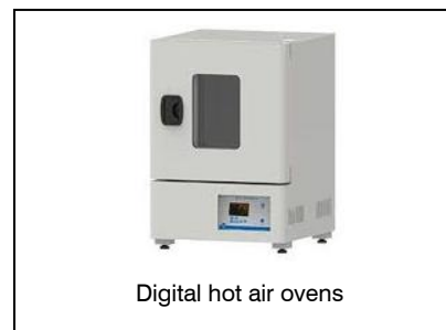
Digital hot air ovens