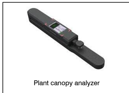
Plant canopy analyzer