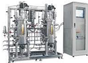
Automated lab fermenter/bioreactor