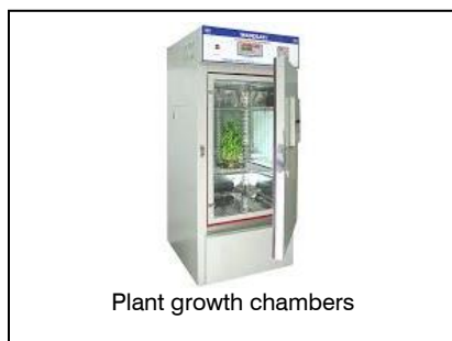
Plant growth chambers