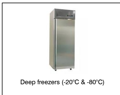
Deep freezers (-20°C & -80°C)