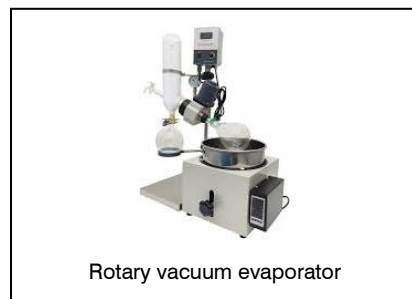
Rotary vacuum evaporator