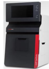
Gel documentation unit