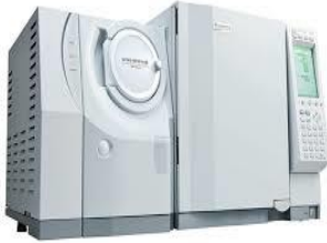
Gas Chromatograph Mass Spectrometer