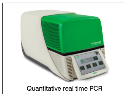
Quantitative real time PCR