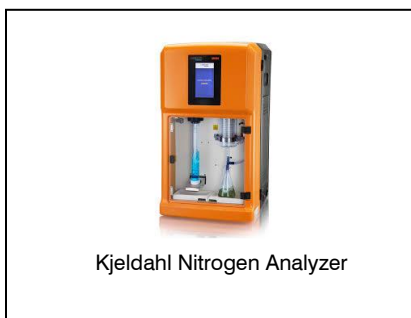
Kjeldahl Nitrogen Analyzer