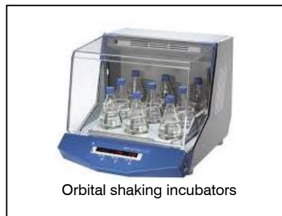
Orbital shaking incubators