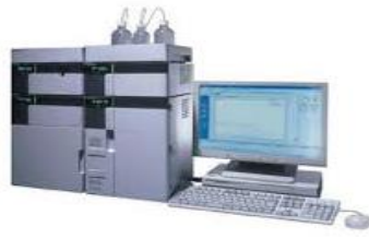
High Performance Liquid Chromatography