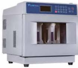
Microwave digestion system