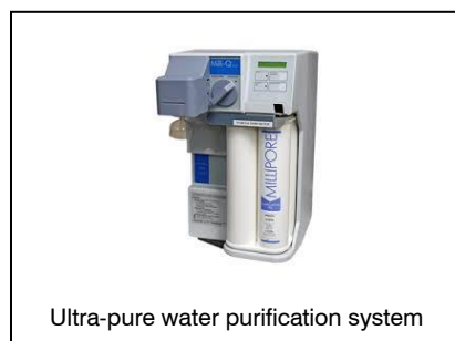
Ultra-pure water purification system