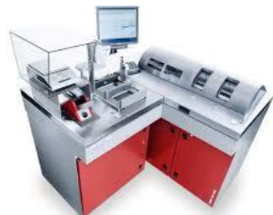
HVI Fibre testing machine