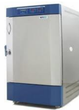
Programable BOD incubators