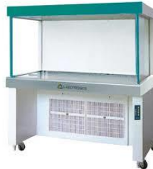
Laminar Flow cabinets