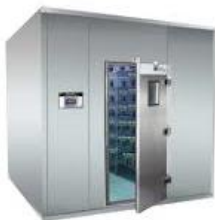
Walk-in growth chamber