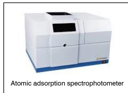
Atomic adsorption spectrophotometer