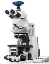
Phase contrast/fluorescence microscope