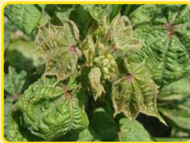
cotton leaf curl disease