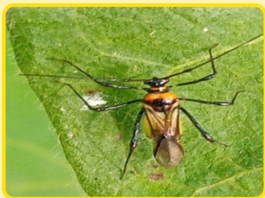
Female tea mosquito bug