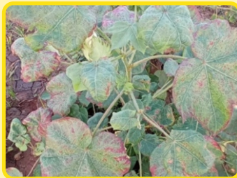
Thrips and its damage symptoms