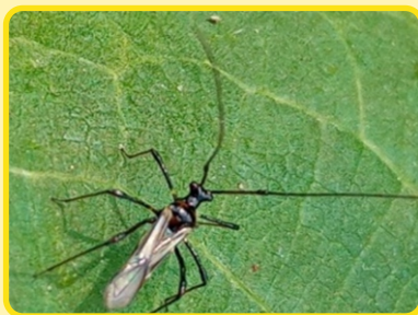
Male tea mosquito bug