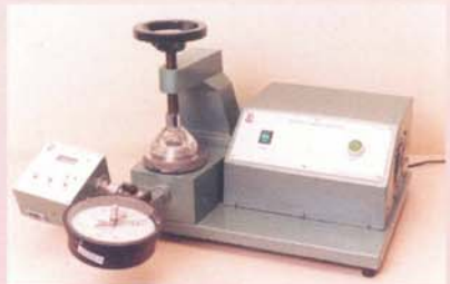
Bursting Strength Tester