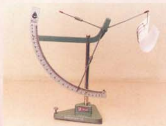
Quadrant Scale for Grammage