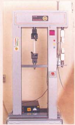
Tensile Strength Tester

CIRCOT has established a well equipped paper testing facility to undertake work on quality assessment of various grades of pulp and paper prepared from agro-residues and processing wastes. This facility is not only used for undertaking research work, but also available for evaluation of pulping and paper making potential of various ligno-cellulosic raw materials. In addition the Institute also undertakes commercial testing of paper and paper board samples received from trade, industry, Government organisations, etc.