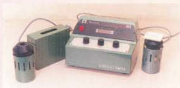
Brightness, Gloss & Opacity Tester