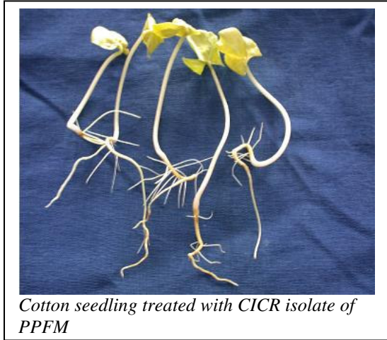
Cotton seedling treated with CICR isolate of PPFM

Pink Pigmented Facultative Methylophs (PPFM) are ubiquitous in nature found in variety of habitats including soil, dust, fresh water lake sediments, leaf surface and nodules. These organisms